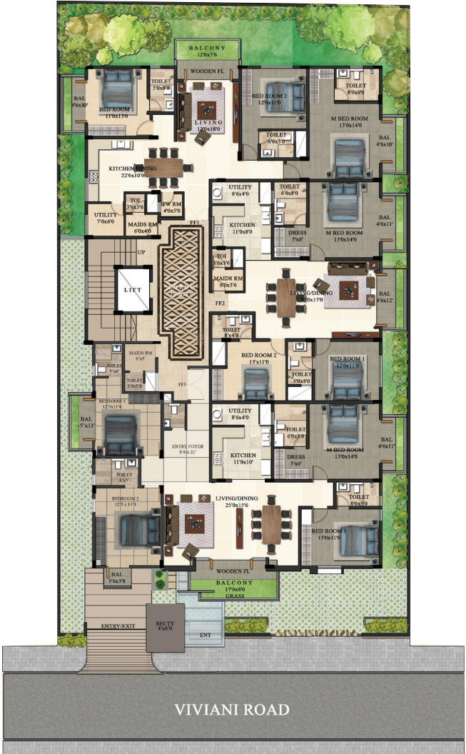
1 st , 2 nd & 3 rd Floors