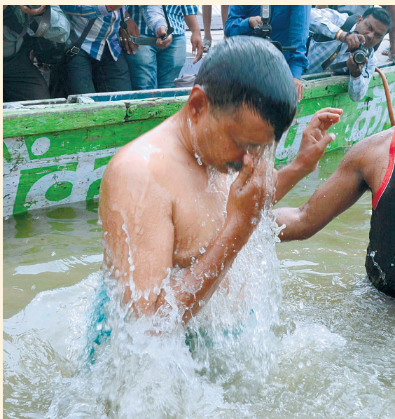
Arvind Kejriwal takes a dip in the Ganga in Varanasi on Tuesday.